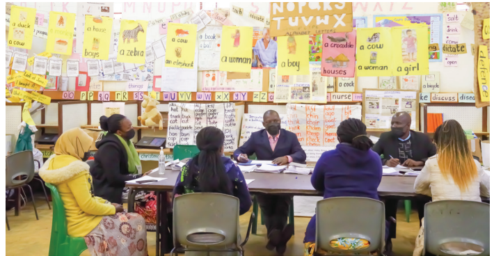
Baseline situational analysis at Teacher Training Colleges in Malawi.

sessions or survey pre-service teachers on literacy instruction efficacy. Data collection is efficient, often completed in phased visits to minimize disruption.