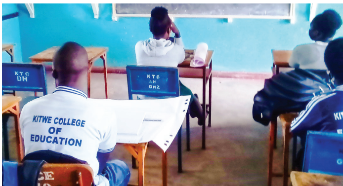
Data collection in Zambia for Transforming Teacher Education.

1. Planning and Design: We begin with a thorough needs assessment, collaborating closely with clients to define evaluation objectives, research questions, and success metrics. This might involve aligning evaluations with goals like improving agricultural literacy or vocational training for rural communities. We conduct document reviews of policies, curricula, and frameworks to establish baselines and identify gaps. Sampling strategies—such as purposive selection for key informants and convenience sampling for broader groups—ensure representative data from diverse participants, including educators, learners, and administrators.